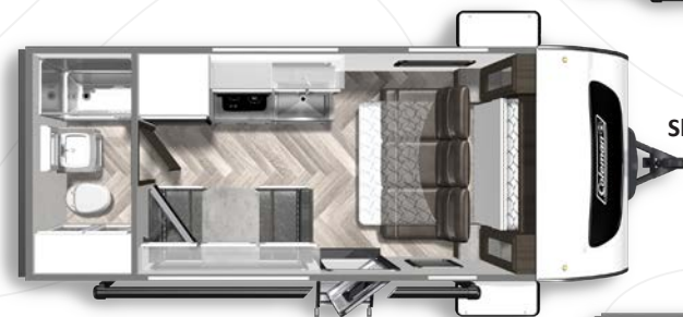
COLEMAN RUBICON 1648RB Length: TBD Weight: TBD Sleeps: TBD Hitch: TBD Height: TBD