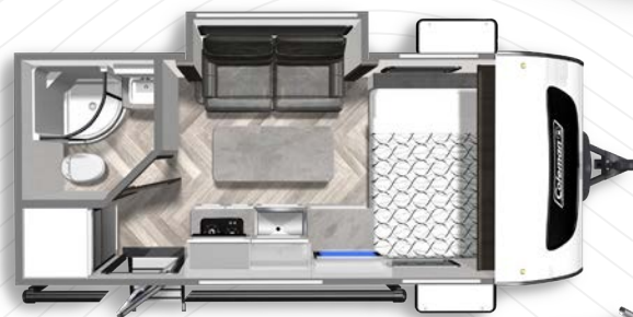
COLEMAN RUBICON 1608RB Length: 20' 7" Weight: 3,882 lbs. Sleeps: 2-4 Hitch: 525 lbs. Height: 10' 5"