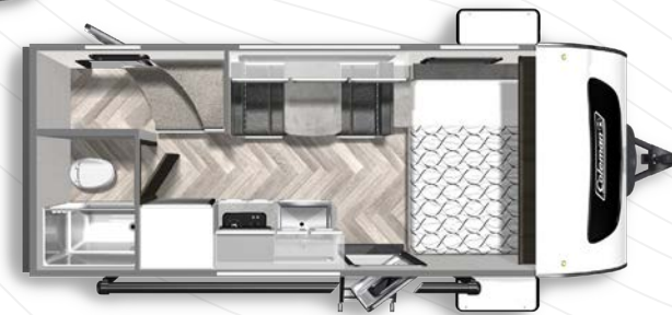
COLEMAN RUBICON 1628BH Length: 20' 11" Weight: 3,657 lbs. Sleeps: 2-4 Hitch: 555 lbs. Height: 10' 5"