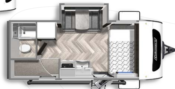
COLEMAN RUBICON 1708BH Length: 21' 5" Weight: 3,855 lbs. Sleeps: 4-6 Hitch: 482 lbs. Height: 10' 5"